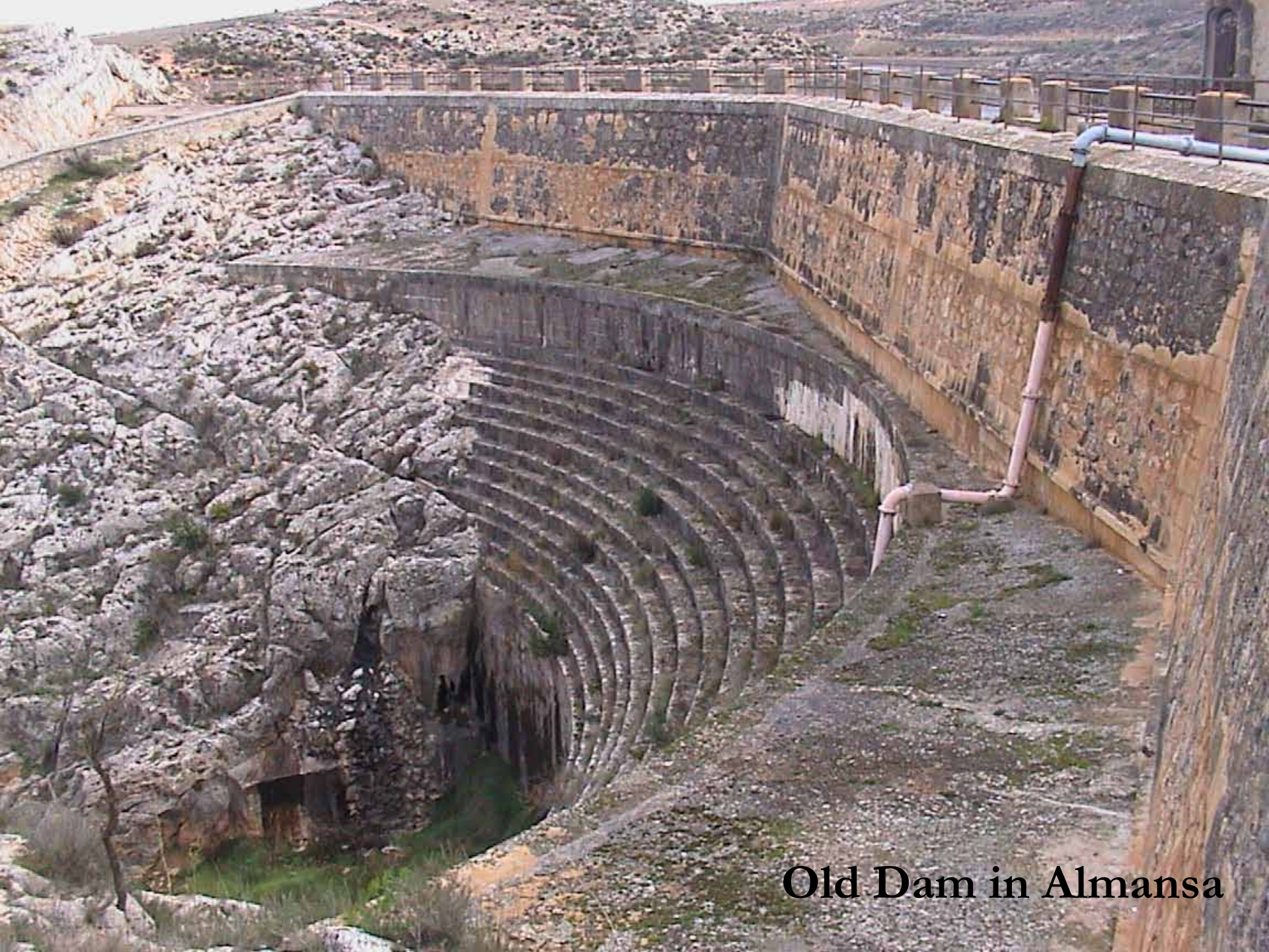
Old Dam in Almansa